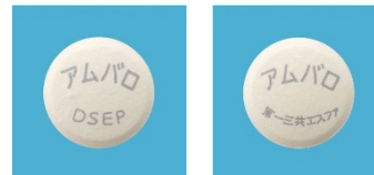
AMVALO® Tablets “DSEP”