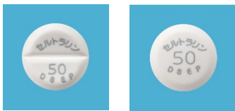
Sertraline Tablets 50mg “DSEP”