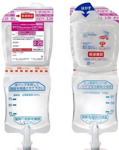
TAZOPIPE® Combination Drip I.V. Bag 2.25 DSEP